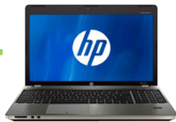
HP Notebook Compatible with Letters alive