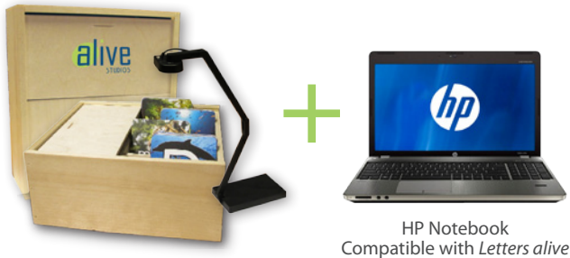
HP Notebook Compatible with Letters alive

This bundle includes everything in Bundle A + teacher's cart + HP Notebook. The teacher's cart is customized just for Letters alive . It includes a side shelf, card and mat storage, card staging area -- all in a lockable multimedia cart on wheels.